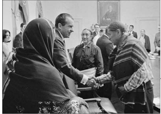
In the early 1970s, President Nixon met with Indian leaders and initiated policies that led to the Indian Self-Determination and Education assistance Act of 1975.

Indian monies collected by the federal government as revenues for the tribe or tribal members and derived from the exploitation of the natural resources of Indian lands are depos-