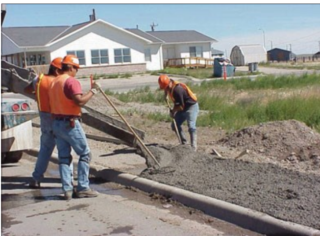
Road repair in Indian country. Improved technology and communication have allowed tribes, state departments of transportation, and the federal government to address transportation needs more effectively.