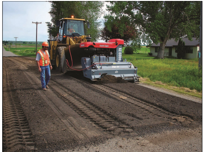
6 Foot Asphalt Zipper Shown Pulverizing a County Road

One of the best results about owning a Zipper, he said, is that they are able to employ some of their own people as road crew.